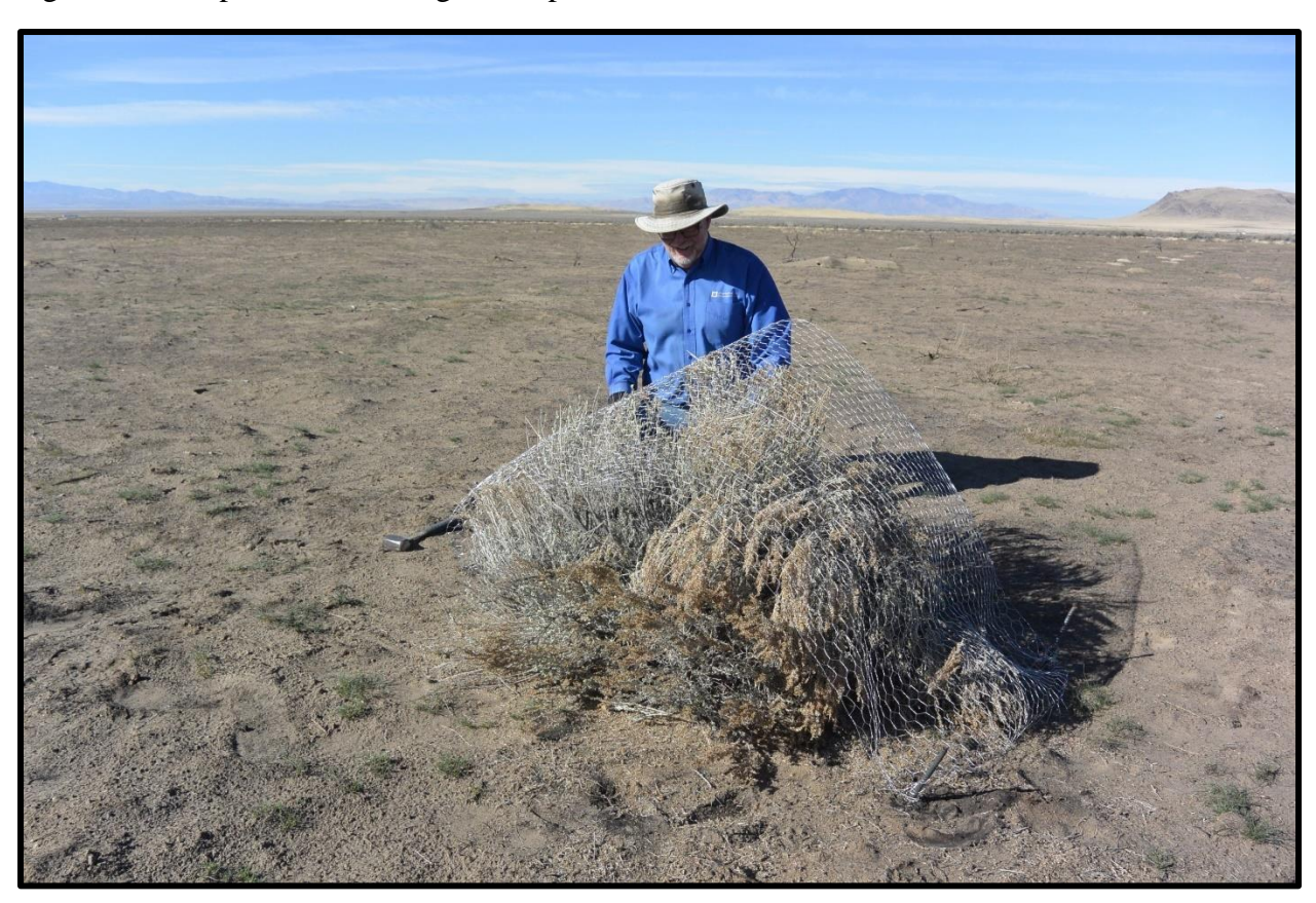
Figure 2. Example of a cache sagebrush plot established in November 2016.