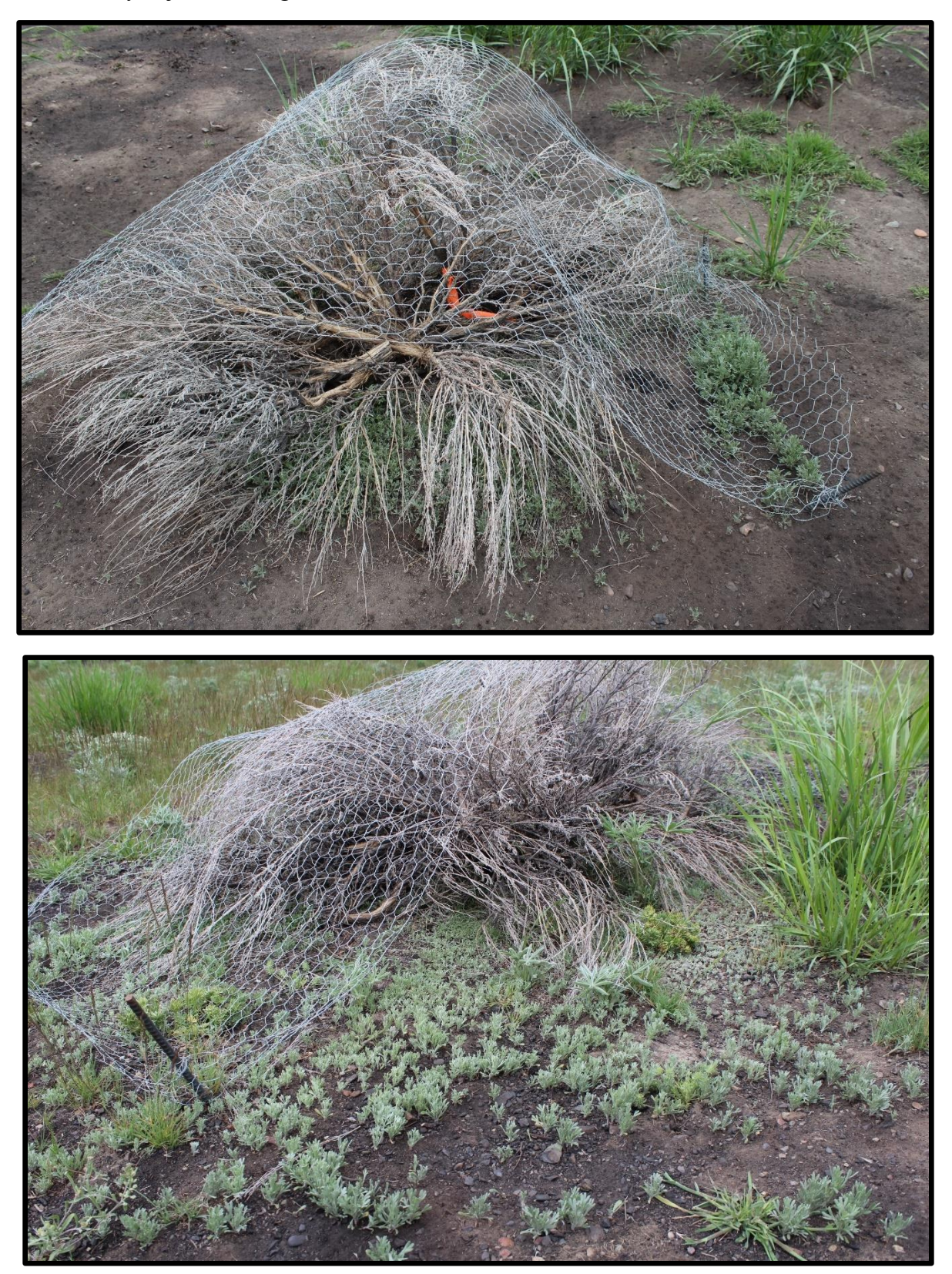
Figure 3. Examples of the "carpet of seedlings" present in late May 2017 beneath and immediately adjacent to sagebrush cache's established in November 2016.